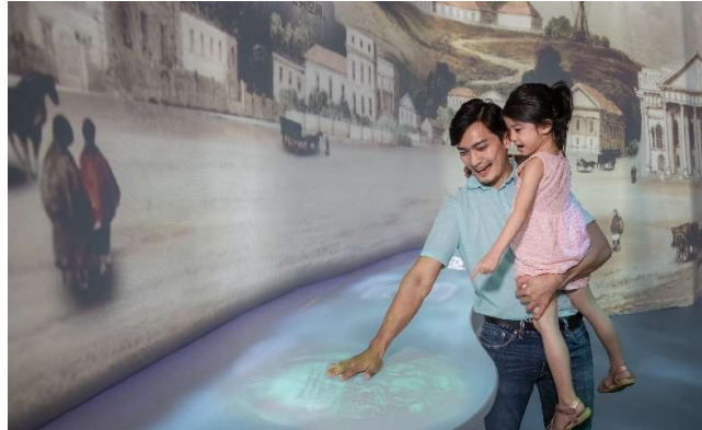
The River of Time

Learn about the events, such as the signing of the 1819 treaty and Jackson Town Plan, that have transformed Singapore from a small idyllic island to the bustling global metropolis it is today. Witness the changing Singapore skyline through a sweeping panorama of historical and contemporary footages from the nation's pre-independence years, its early days of nation-building, to modern-day Singapore.