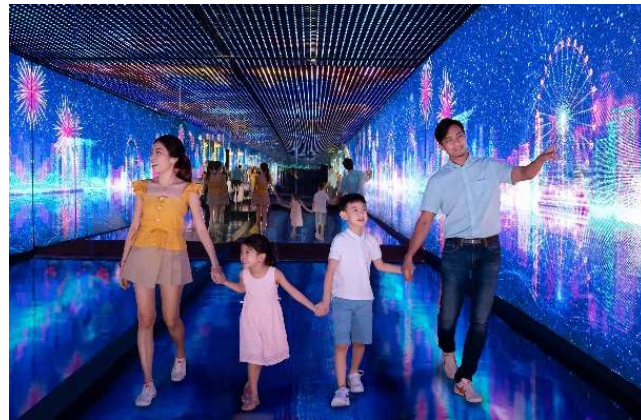
Ignite your imagination at the Infinity Space

Learn about the events, such as the signing of the 1819 treaty and Jackson Town Plan, that have transformed Singapore from a small idyllic island to the bustling global metropolis it is today. Witness the changing Singapore skyline through a sweeping panorama of historical and contemporary footages from the nation's pre-independence years, its early days of nation-building, to modern-day Singapore.